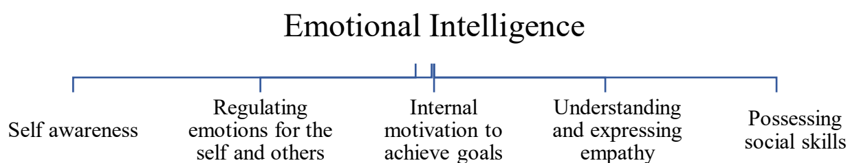
Figure 1: Emotional Intelligence

We employ our emotional intelligence every day in our social interactions with others (Ciarocchi et al., 2006; Goleman, 1995/2005). One general definition of emotional intelligence is the ability to recognize and regulate one's emotions (Wischerth et al., 2016). According to Goleman (1995/2005) emotional intelligence includes the skills and abilities involved in processing, understanding, interpreting, and regulating our own emotions and the emotions of social others. The five main components to one's emotional intelligence are: 1) self-awareness - evaluating and expressing emotions in oneself and others, 2) regulating these emotions in both oneself and others, 3) using internal motivation to plan and achieve certain tasks, 4) understanding and expressing empathy, and 5) possessing social skills. Because emotional intelligence improves mental processes, this can contribute to an enhancement in social outcomes, performance, and overall mental and physical well-being. These appear in Figure 1.